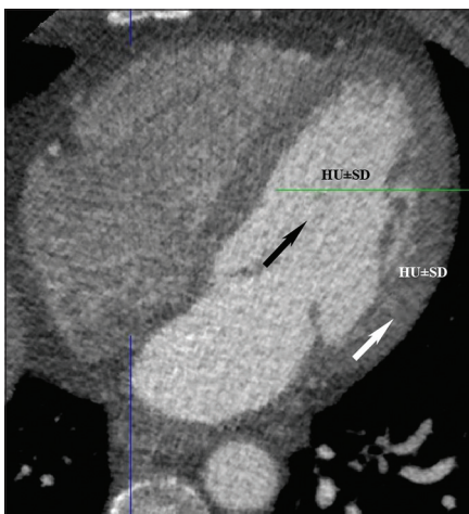
Figure 1: 55-year-old-male with chest pain. Normal axial computed tomography shows region of interest in left ventricular chamber (black arrow) and left ventricular wall (white arrow) for image noise, signal to noise ratio and contrast to noise ratio.

Two experienced independent readers analyzed the same data set independent of each other and blind to patient characteristics for inter-reader variability. One reader repeated the analysis to determine intra-reader variability. Subjective image quality was assessed using the 16-segment model proposed by the AHA. [26] Images were analyzed in axial, curved MPR and MIP imaging using an established ordinal scale from 1 to 3 (1 = Excellent, 2 = Good and 3 = Non-diagnostic). [14,21,27] Segments were identified as non-diagnostic due to significant motion artifact, poor vessel opacification, structural discontinuity, and high image blurring. The difference between two readers was resolved by a consensus opinion.