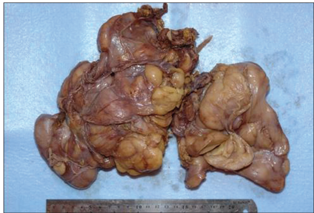
Figure 2: Gross examination of the mass revealed a large, encapsulated, yellow-brown colored fatty tissue measuring 27×18×4.5 cm. The mass weighed 858 gm, with variable consistency on palpation. In addition, atrophic testis was adherent to the mass and measured 3×2.5×1.5 cm in size.