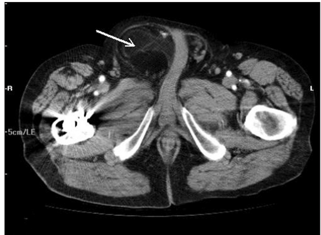
Figure 1: Computed tomography image demonstrates a lipomatous mass (arrow).

The typical clinical characteristics of a well-differentiated liposarcoma are a painless, slow-growing (months to years) soft-tissue mass. However, pain and tenderness have been reported in 10–15% of the cases. [3] Rapid growth, large size, and symptomatic presentation are features suggestive of malignancy. Tumors range from 3 to 30 cm in diameter and are gray-white to yellow-