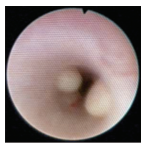
Figure 1: A 62-year-old female with ureteritis cystica of bilateral ureters. Retrograde pyleogram shows multiple smooth, well-rounded filling defects with sharp borders that protrude into the lumen of the ureter.