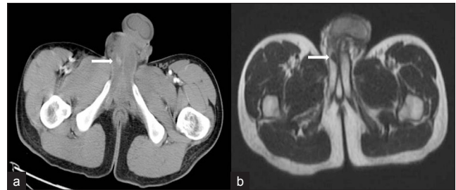
Figure 1: Right cavernosal artery pseudoaneurysm in a 19-year-old boy with right hip pain. (a) CT and (b) MRI images at the level of lower pelvis shows blotches of contrast (white arrows) in shaft of the penis on the right side.

The high flow priapism is due to increased arterial inflow caused by trauma to the cavernosal artery in which the corporal artery is compressed against the pubic bone. [3] Few instances of idiopathic etiology are reported. This results in formation of arteriocavernosal fistula with or without a pseudoaneurysm. The erection can occur up to 8 hours after the traumatic event. Since arterial inflow is good, there is no ischemia. However untreated cases will proceed to permanent impotence. Selective transcatheter arterial embolization is the current treatment of choice in cases of high flow priapism. [4]