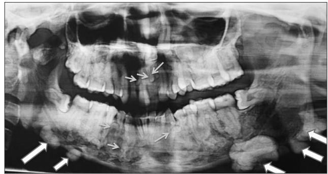
Figure 4: OPG demonstrates impacted teeth 21 and 23, homogenous radiopaque masses over the right and left inferior aspect of the mandible suggestive of osteomas (large arrows). Also multiple small, homogeneous radiopaque masses surrounded by a radiolucent halo could be seen throughout the maxilla and mandible suggestive of complex odontomes (small arrows). Diffuse sclerotic masses are present throughout the body of mandible giving it a mottled appearance

The gastrointestinal manifestations of Gardner's syndrome include colonic adenomatous polyps (tubular, villous, tubulovillous), gastric and small intestinal adenomatous