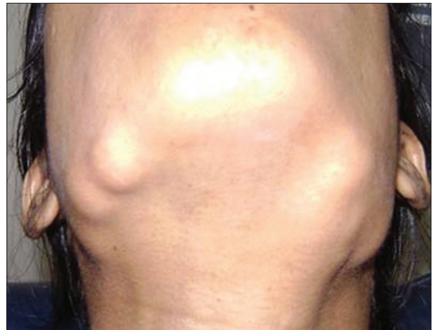
Figure 1: Extraoral osteomas. A 25-year-old female patient with diffuse bilateral swellings on the lower third of face along the mandibular border.

The patient underwent maxillary and mandibular cross-sectional occlusal radiograph, orthopantomograph (OPG), and posteroanterior radiograph [Figure 3]. The OPG revealed