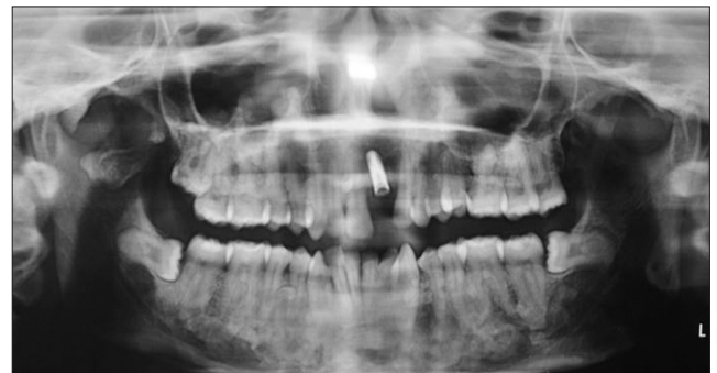
Figure 2: Postoperative radiograph after removal of osteomas, impacted teeth, and implant placement, with respect to tooth 21.