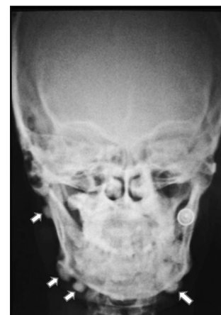
Figure 3: Posteroanterior radiograph shows extra-oral osteomas along the mandible (white arrows).