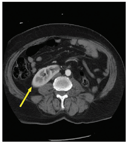
Figure 2: Single selected axial computed tomography scan image of the abdomen performed in the post-operative period shows resection of the large mass in the left part of the horseshoe kidney with organ preserving surgery. The right part is grossly unremarkable (arrow).

Horseshoe kidney is the most common type of renal fusion anomaly. Horseshoe kidney occurs in 1 per 400-600 live births.<sup>[1]</sup>The true incidence probably lies somewhere between these two extremes. However, the reported incidence in the literature is about 0.25%.<sup>[2]</sup> Horseshoe kidney is twice as