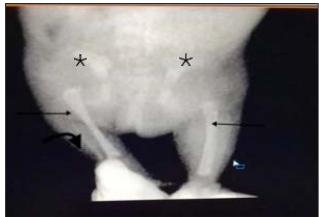
Figure 6: Postnatal X-ray infantogram confirms the prenatal observations. Bilateral femur bones are not seen. Bilateral proximal tibia (arrows) appears femur-like in shape and tibia is seen forming pseudoarthrosis with the acetabulum (asterisks). The acetabulum appears shallow and dysplastic (asterisks). The right fibula is visualized (bold arrow) but the left fibula is not seen clearly (likely non-ossified).