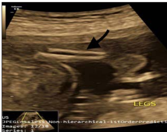
Figure 2a: Antenatal ultrasound at 18–20 weeks at the level of the legs shows normal-appearing bilateral tibia and fibula of the right side (arrow).

Trio whole-exome sequencing (WES) was performed for the child and both the parents using blood as the tissue. No clinically significant variant was identified that can explain the patient's phenotype: short long bone, aplasia/hypoplasia involving the skeletal musculature, abnormality of femur