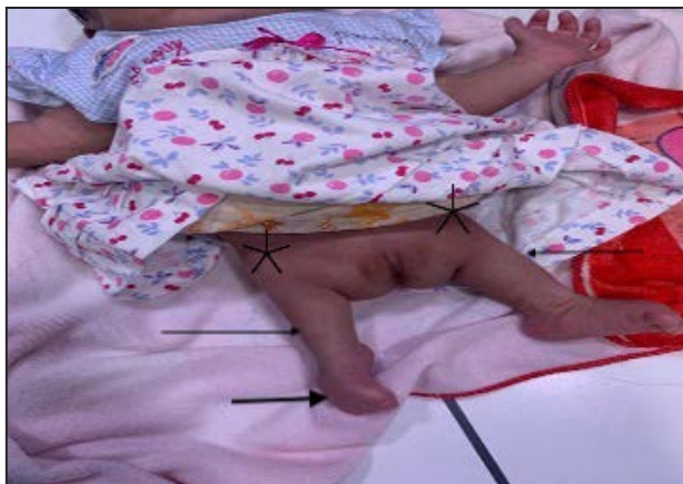
Figure 5: Postnatal clinical photograph of the baby demonstrates bilateral absent thighs with a right-sided club foot. This photograph is exactly the same as shown in the antenatal 3D ultrasound images shown in Figure 3b.