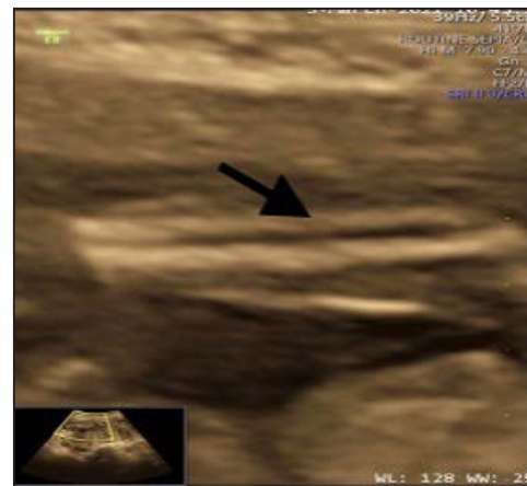
Figure 2b: Antenatal ultrasound at 18–20 weeks at the level of the legs shows a normal-appearing bilateral tibia and fibula of the left side (arrow).