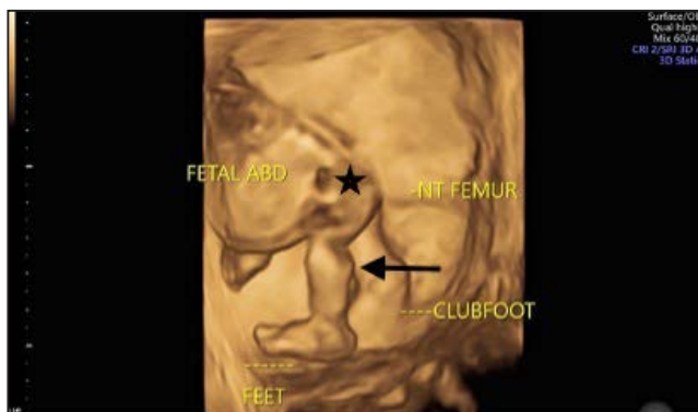
Figure 3a: 3D ultrasound image at the level of lower limbs clearly demonstrates nonvisualized thigh (asterisk) with a normally developed leg (arrow).