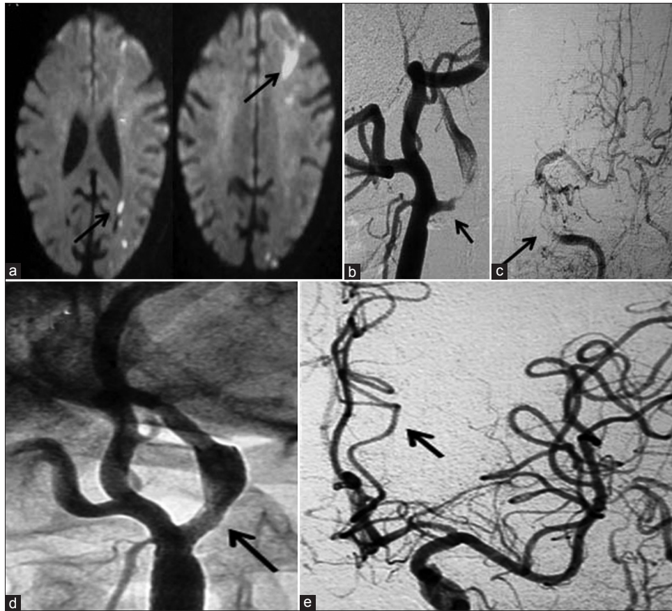
Figure 2: 55-year-old man who presented with recurrent right sided TIAs (Patient 1 in the table) (a) MR DWI shows acute infarcts in the left MCA territory. (b) DSA of Left CCA shows critical stenosis of left ICA and (c) poor antegrade flow in the cerebral circulation (d) Post-procedure left CCA angiogram reveals the patent stented segment (e) with good antegrade flow in cerebral circulation.