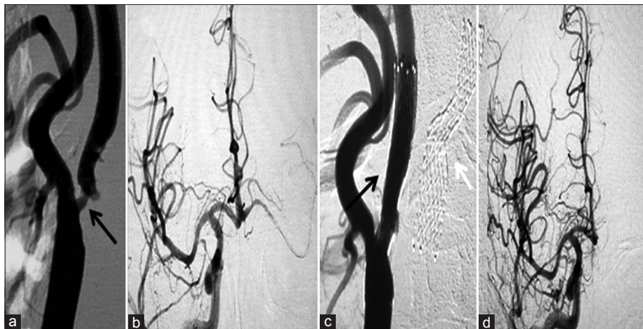
Figure 3: (a) Pre-procedure right CCA angiogram of the same patient (patient 1 in the table) shows severe narrowing of the left ICA, and (b) right cerebral angiogram shows decreased flow. (c) Post-procedure left CCA angiogram shows good flow across the stented segment and (d) shows increased antegrade flow in the cerebral circulation. The stent on the left side is also seen (white arrow in C)

the most rigorous reported to date and may serve as a model for future trials. Our selection criteria of the lesions were based on the same inclusion criteria as those of the CREST trial. The eligibility criteria in CREST trial included patients with >50% stenosis in symptomatic patients and >60% stenosis in asymptomatic lesions detected on