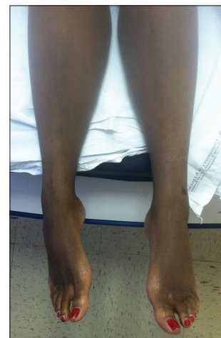
Figure 4: 36-year-old woman with a history of autoimmune hepatitis and two prior orthotopic liver transplants who presented 5 years after her most recent transplant with a chief complaint of progressive bilateral lower extremity edema and weight gain was diagnosed with transplant-related, initially angioplasty-resistant IVC stenosis. Post-treatment photograph demonstrates complete resolution of lower extremity edema.

Venous outflow obstruction is a rare complication of liver transplantation, with an incidence below 2%. [3] Signs and