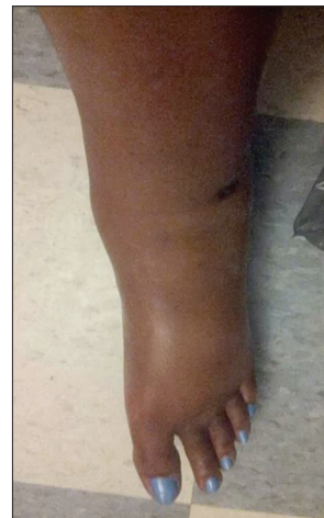
Figure 2: 36-year-old woman with a history of autoimmune hepatitis and two prior orthotopic liver transplants who presented 5 years after her most recent transplant with a chief complaint of progressive bilateral lower extremity edema and weight gain was diagnosed with transplant-related, initially angioplasty-resistant IVC stenosis. Pre-treatment photograph shows marked lower extremity edema.