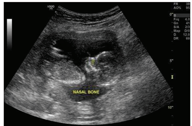
Figure 1: Sagittal gray scale ultrasound image of an intrauterine fetus of gestational age 16 weeks, 3 days showing the measurement method of fetal nasal bone (arrow) as described by Sonek et al. [5]

In contrast to Narayani and Radhakrishnan, the NBL at 16 and 22 weeks in our study was 3.5 mm and 5.8 mm, respectively, which was on the higher side as compared to them.