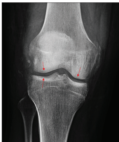
Figure 1: A 22-year-old male after 6 weeks inability to bear full weight, subsequent to knee dislocation. Frontal radiograph of the right knee shows impaction fracture of the medial femoral condyle. Linear demineralization is seen involving the medial femoral condyle, lateral femoral condyle, and lateral tibial plateau (red arrows).

DO may manifest in any setting of reduced weight-bearing, including fractures, inactivity, neuromuscular, and arthritic diseases. Although the exact pathogenesis is not entirely understood, some studies have indicated it likely begins with a hyperemic state in the disused bone and are followed by active bone resorption accompanied by inhibition of bone formation. [1,5-7] This has caused