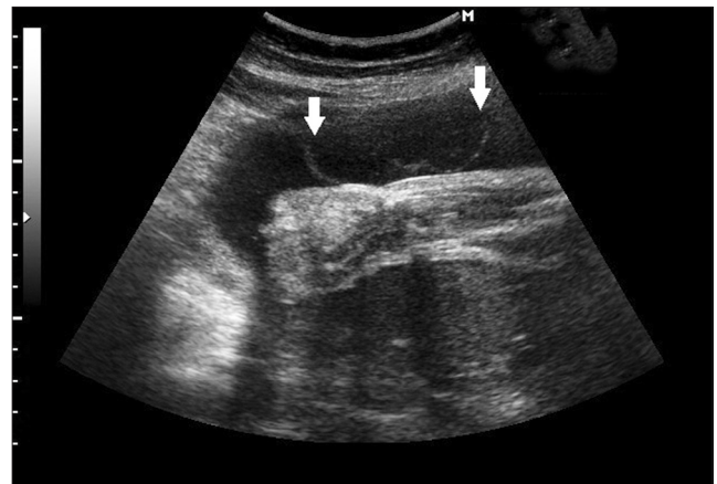
Figure 1: Two-dimensional ultrasonography shows adherence of two amniotic bands to the right forearm of the fetus (white arrows).

Two theories have been formulated in attempts to explain