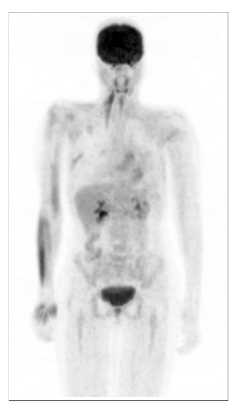
Figure 1: 36-year-old female presented with pain under the left arm and was diagnosed with intermediate-grade DCIS. FDG-PET/CT Maximum Intensity Projection (MIP) image shows only postsurgical changes with no evidence of residual or metastatic disease.

then treated with tamoxifen and radiotherapy. About 3 years later, the patient presented with multiple skin nodules on the chest and upper left arm. FDG-PET/CT revealed extensive metastatic disease involving left axillary lymph nodes, left suprascapular muscle, chest, and left upper arm [Figure 2a–c]. Biopsies were done on the chest, left suprascapular muscle, and left axillary lymph nodes and they showed poorly differentiated ER+/PR-/Her-2-adenocarcinoma. She was experiencing progressive pain and weakness in the left upper extremity.