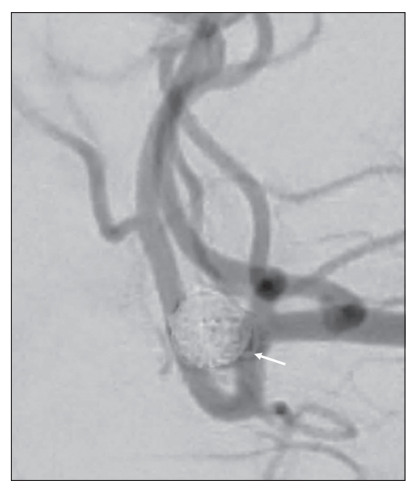
Figure 4: A 64-year-old woman with a ruptured wide-necked bifurcation aneurysm of the right middle cerebral artery who presented with sudden onset severe headache. Digital subtraction angiography during right internal carotid artery contrast injection, performed during the 6th month follow-up visit showing occlusion of aneurysm, persistence of prolapsed coil loop (arrow), and normal flow in the middle cerebral artery and its branches.

Deployment of a stent with its distal end within an aneurysm instead of bridging the neck is called the "waffle cone technique" and has been successfully applied using Neuroform, Enterprise, and Solitaire AB stents.<sup>[3,13-15]</sup> The pCONus device is a stent exclusively made for this