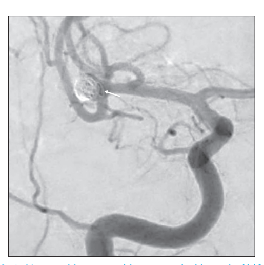
Figure 3: A 64-year-old woman with a ruptured wide-necked bifurcation aneurysm of the right middle cerebral artery who presented with sudden onset severe headache. Postprocedural digital subtraction angiography during right carotid artery injection showing minimal filling of the aneurysm, patent middle cerebral artery branches, and prolapse of a coil loop into the middle cerebral artery (arrow).