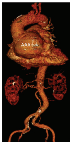
Figure 1: A 78-year-old male with history of aortic valve replacement presented with dyspnea on exertion. Three dimensional reconstructed image of computed tomographic of the aorta shows giant aortic root of 10.2 cm labeled as ascending aortic aneurysm.

There were two options in this case: coronary CT angiography or conventional coronary angiography. Coronary CT angiography would require about 150 ml of contrast. [2]