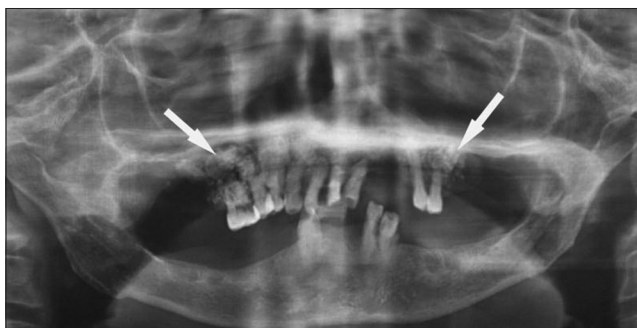
Figure 3: 70-year-old male with perforation in the left maxillary region diagnosed with Paget's disease. Panoramic radiograph shows generalized mixed radiolucent and radiopaque areas in the maxilla and mandible (arrows) with characteristic cotton wool appearance in the left maxilla.