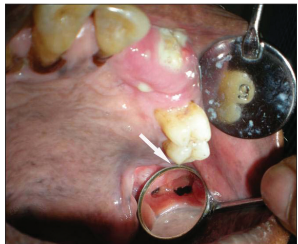
Figure 2: 70-year-old male with perforation in the left maxillary region diagnosed with Paget's disease. Intraoral clinical photograph shows a fistulous tract (arrow).