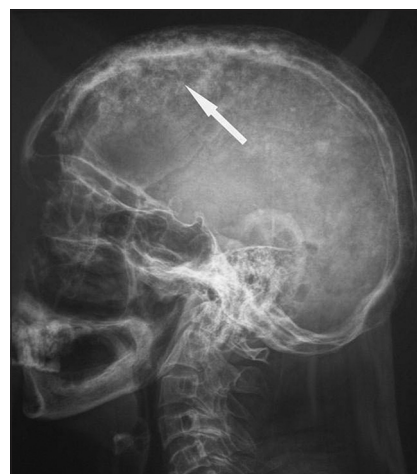
Figure 4: 70-year-old male with perforation in the left maxillary region diagnosed with Paget's disease. Lateral skull view shows generalized mixed radiolucent and radiopaque areas (arrows) suggestive of Pagetic calvaria.