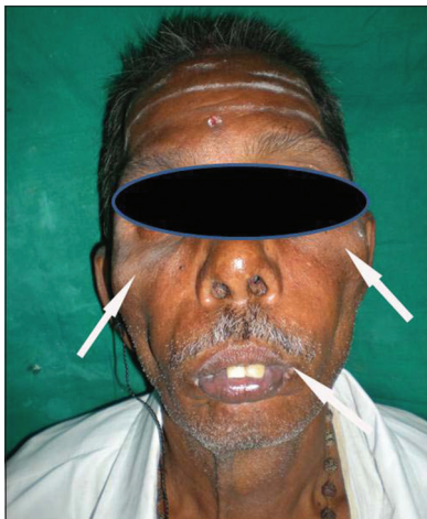
Figure 1: 70-year-old male with perforation in the left maxillary region diagnosed with Paget's disease. Extra-oral clinical photograph shows enlarged cranium, zygoma, and incompetent lips (arrows).

On correlating the clinical, radiographic, histopathological, and biochemical findings, it was finally diagnosed as a case of PD involving the maxilla and skull. An obturator was