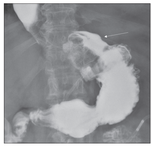
Figure 2: Single contrast upper gastrointestinal examination in the supine anteroposterior view shows increased phi angle and prominent gastric pouch (arrow) concerning for mild lap band slippage.