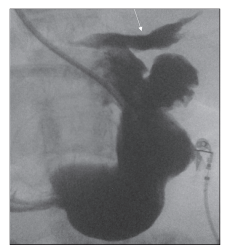
Figure 5: Single contrast upper gastrointestinal in the anteroposterior view shows contrast extravasation into and layering along the inferior pericardial sac (arrow).

Essentially, any erosion through the stomach wall can lead to a gastropericardial fistula given their close anatomic proximity. Although there have been no documented cases of lap band gastropericardial fistulas, gastric ulceration, and perforation are well-documented complications. These can easily lead to fistulous connections with surrounding organs. Given the high morbidity, mortality, and the rarity,