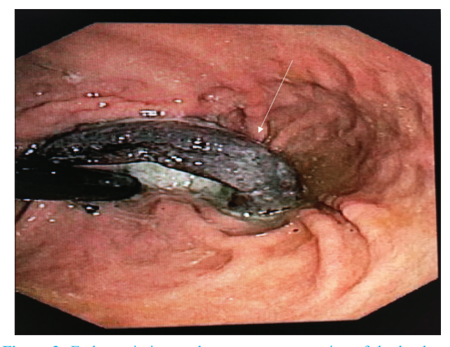
Figure 3: Endoscopic image demonstrates an erosion of the lap band through the gastric wall (arrow).

abscesses and fistulous connections to the pericardial sac from etiologies such as liver abscesses, peptic ulcers, or gastric carcinomas.<sup>[2]</sup>