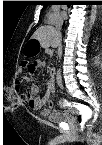
Figure 1: A 57-year-old male who presented for assessment of anastomotic dehiscence. Sagittal reconstruction of a CT with water soluble rectal contrast using a traditional (single balloon) rectal catheter. There was incomplete distension of the colon with contrast material leaking around the tube due to inadequate seal and incontinence.

To address these issues, it was decided to change our routine clinical practice. Our group was familiar with a novel double balloon catheter that was already being used clinically in the pediatric division at our institution. This novel dual balloon catheter (originally designed for air enema reduction of ileocolic intussusception) [7] was already FDA approved for general rectal use in adults and children, therefore it was accepted for clinical use by our division. It is important to note that this catheter