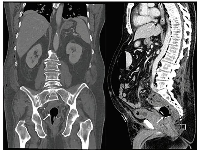
Figure 2: A 74-year-old male who underwent recent LAR. Coronal and sagittal reconstructions demonstrate a single balloon catheter inflated above the anastomosis (white arrow). Despite extra-luminal gas surrounding the anastomosis, the rectal contrast material is not in the appropriate location to assess for the anastomotic leak.

was designed and is solely owned by an employee of the Department of Radiology at the Medical University of South Carolina. However, the decision for the clinical use of this catheter was based on the clinical discretion of physicians who were not involved in the design or development of this catheter. Further, individuals with no ownership stake in the company undertook this manuscript as an independent endeavor. Additionally, this catheter has not been marketed for use in