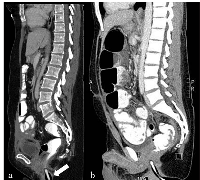
Figure 5: (a) Sagittal reconstruction of a rectal enema CT using the dual balloon catheter however the distal balloon has been inflated BELOW the anorectal junction (arrow). Note the quality of the colonic distention remains diagnostic. (b) Sagittal reconstruction of a rectal enema CT using the dual balloon catheter, however the distal balloon has not been inflated. The conical shaped proximal balloon has been inflated with the degree of colonic distention remaining diagnostic.