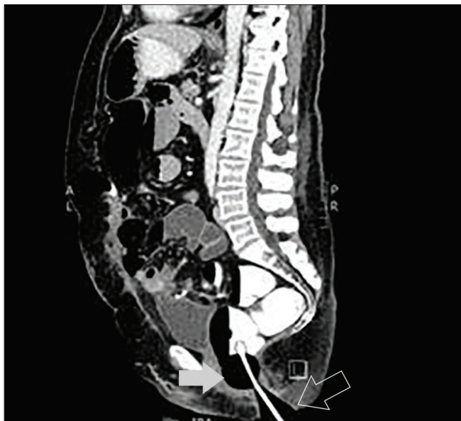
Figure 4: Sagittal reconstruction of a rectal enema CT using the dual balloon catheter to fill the colon with both proximal (white arrow) and distal (outline arrow) balloons inflated.