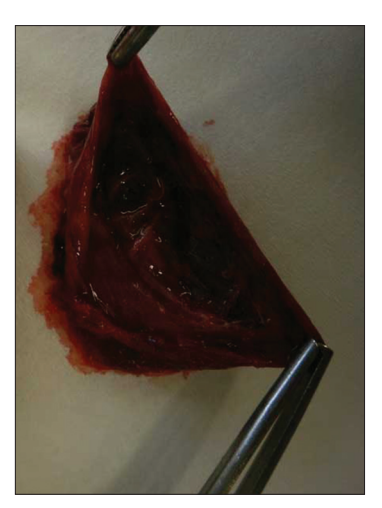
Figure 3: 18-year-old male with progressive dyspnea on exertion and dry cough diagnosed with bronchogenic cyst. Photography the surgically removed mass shows the resected thin-walled and unilocular cyst measuring a maximum of 4.5 cm × 3.5 cm × 2.5 cm and containing mostly mucous brownish fluid.

in the mediastinum. Some cysts that lie beneath the carina cannot be visualized by chest X-ray. Moreover, CT scan and magnetic resonance imaging (MRI) may both provide accurate diagnosis of bronchogenic cysts using typical characteristics of a round, well-circumscribed, unilocular mass with density of water. More specifically, uniform low T1 and high T2 intensities, indicative of water density, are demonstrated on MRI. Roughly, half of the cysts have attenuation values of soft-tissue because of viscous mucoid contents making them indistinguishable from neoplasms. [4] Although magnetic resonance may help to further differentiate these lesions, they can still be confounded with malignancies presenting with central necrosis.