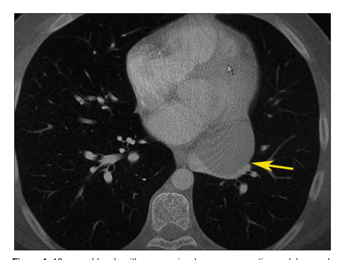
Figure 1: 18-year-old male with progressive dyspnea on exertion and dry cough diagnosed with bronchogenic cyst. Contrast-enhanced computed tomography of the chest (lung window) shows a well-defined round homogeneous low-density mass in the mediastinum adjacent to the left main bronchus measuring 5.1 cm × 5.8 cm at its maximum, causing over 80% luminal narrowing of both left pulmonary veins (yellow arrow).

Patient underwent complete surgical excision of the mediastinal cyst through a left posterolateral thoracotomy and exhibited an uneventful recovery. Grossly, the cyst was smooth, thin-walled, and unilocular measuring a maximum of 4.5 cm \times 3.5 cm \times 2.5 cm and containing mostly mucous brownish fluid [Figure 3]. Aspiration of the cyst contents was initially performed to make the cyst technically easier to remove. Then, the cyst was carefully dissected free of its mediastinal and pleural attachments, taking care not to leave any residual cyst wall behind. Histopathologically, the cyst was lined by respiratory epithelium with areas of sub-epithelial fibrosis [Figure 4]. A slight chronic inflammation of the epithelial lining was also noted. Microbiologic and cytologic examinations of cyst fluid were negative for any pathogen development or malignancy, respectively. The afore-mentioned findings were consistent