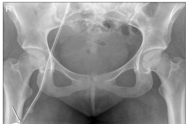
Figure 2: An abdominal radiograph shows the tip of the guide wire originating from the hemodialysis catheter inserted in the right femoral vein.