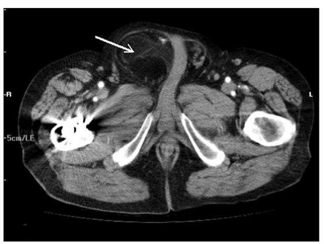
Figure 1: Computed tomography image demonstrates a lipomatous mass (arrow).

The typical clinical characteristics of a well-differentiated liposarcoma are a painless, slow-growing (months to years) soft-tissue mass. However, pain and tenderness have been reported in 10–15% of the cases. [3] Rapid growth, large size, and symptomatic presentation are features suggestive of malignancy. Tumors range from 3 to 30 cm in diameter and are gray-white to yellow-