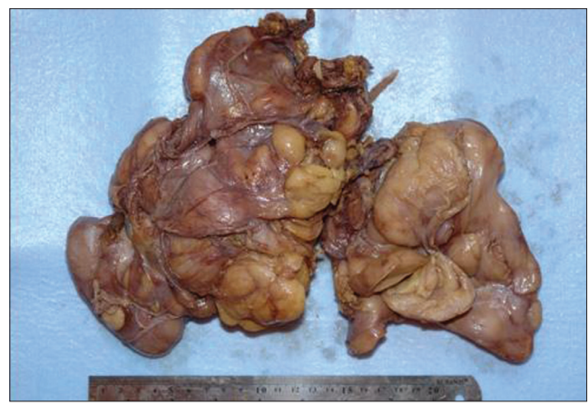
Figure 2: Gross examination of the mass revealed a large, encapsulated, yellow-brown colored fatty tissue measuring 27×18×4.5 cm. The mass weighed 858 gm, with variable consistency on palpation. In addition, atrophic testis was adherent to the mass and measured 3×2.5×1.5 cm in size.