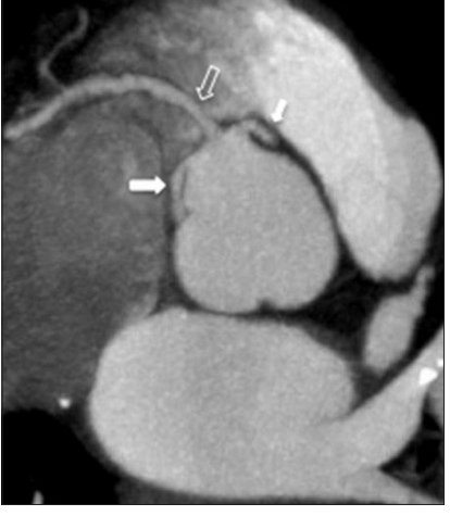
Figure 1: 56-year-old male patient admitted with chest pain diagnosed with three coronary arteries originating separately from the right coronary sinus. Axial oblique maximum intensity projection image shows left anterior descending artery (short white arrow), right coronary artery (open arrow), and left circumflex artery (long white arrow) – three coronary arteries originating from the right coronary sinus.

Coronary artery anomalies consist of anomalies of origin, course, or both. Coronary arteries may take origin from the opposite or noncoronary sinus and show an anomalous course. The RCA arising from the left coronary sinus, the LCA arising from the right coronary sinus, the LAD or LCx